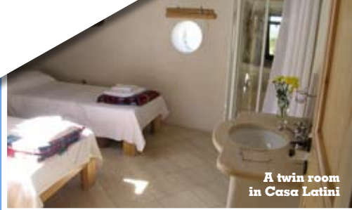
A twin room in Casa Latini