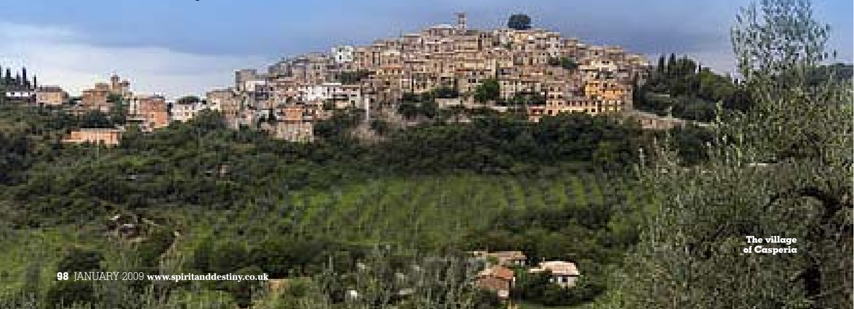
The village of Casperia