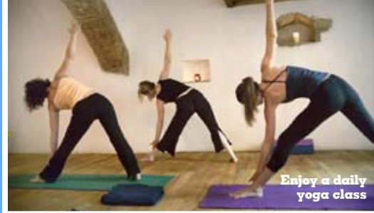
Enjoy a daily yoga class